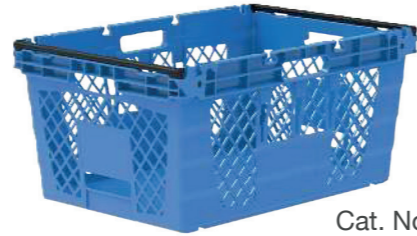
Cat. No. 6428 Nestable