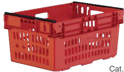
Cat. No. 6430 Nestable