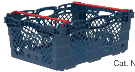
Cat. No. 6425 Nestable