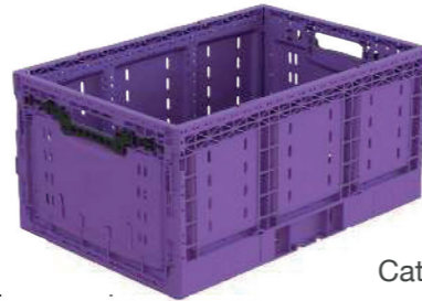
Cat. No. 6428 AL Foldable