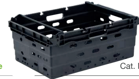
Cat. No. 6425-S Nestable