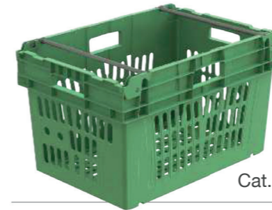
Cat. No. 6436-P Nestable