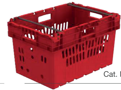
Cat. No. 6436-S Nestable